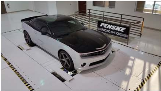
Testing Rig Shown