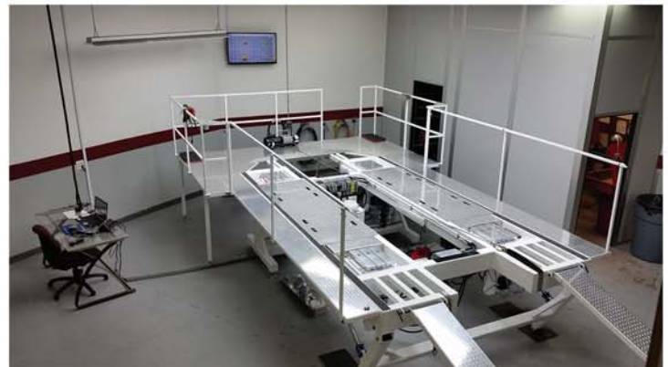
Pull Down Rig Shown