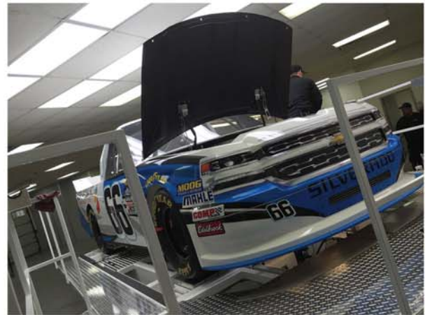
Truck mounted on Rig Shown